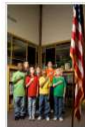
Pledge of Allegiance