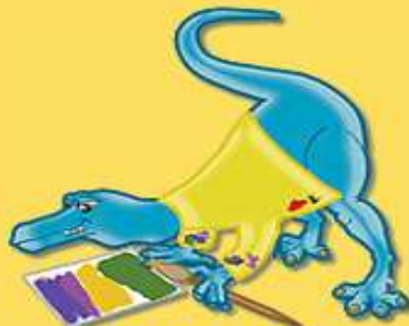
Art & Music