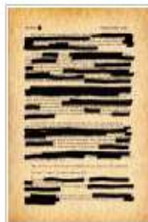
Censorship & Democracy