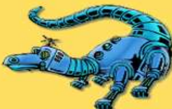
Science & Math